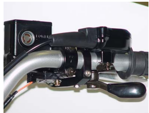
Rear view of ATV throttle, mount bracket is positioned under brake lever.