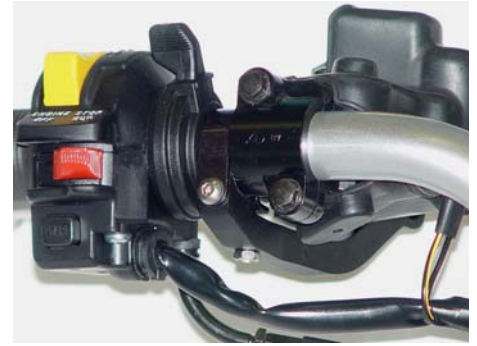
Right side view of ATV, bracket is positioned under brake lever and angles toward center.

When mounting the handguard to the bracket, make sure the no-spin spacer is positioned so that the pin goes into the back hole of the bracket and the bolt goes through the front hole. Also make sure the no-spin spacer is positioned so that its tabs go over one of the handguard tabs as in the Option photos below.