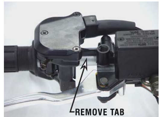
Photo 1 - front view of ATV throttle

STEP 3: Insert the M6 x 25mm hex head bolt through the bracket and thread into the strap. This adjustment screw is used to achieve the desired tightness of the mount. Leave the bracket loose enough for now so you can adjust the position up or down after attaching the hand guard to the bracket.